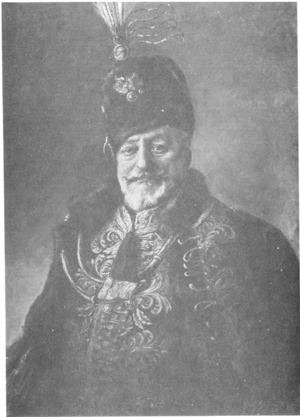
"Count Géza Andrassy" — painted by author