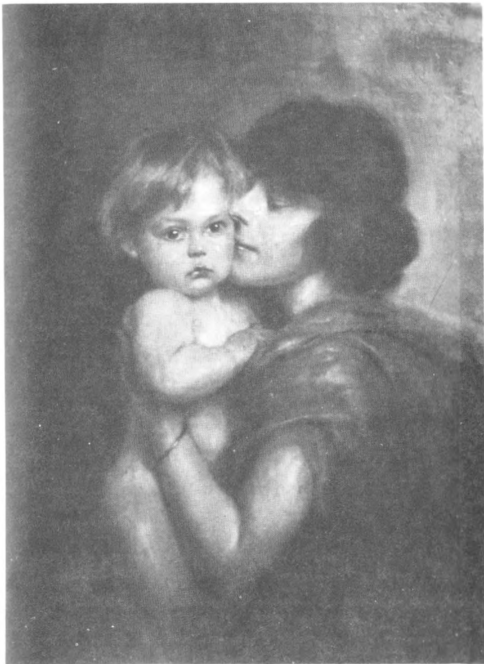
"Mother With Child" painted by author