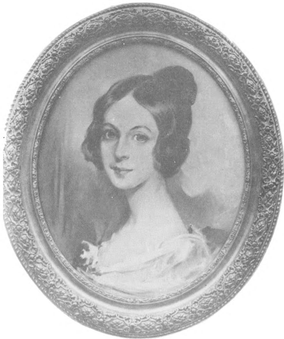
Countess Claudia Rhédey, grandmother of the late Queen Mary — painted by author