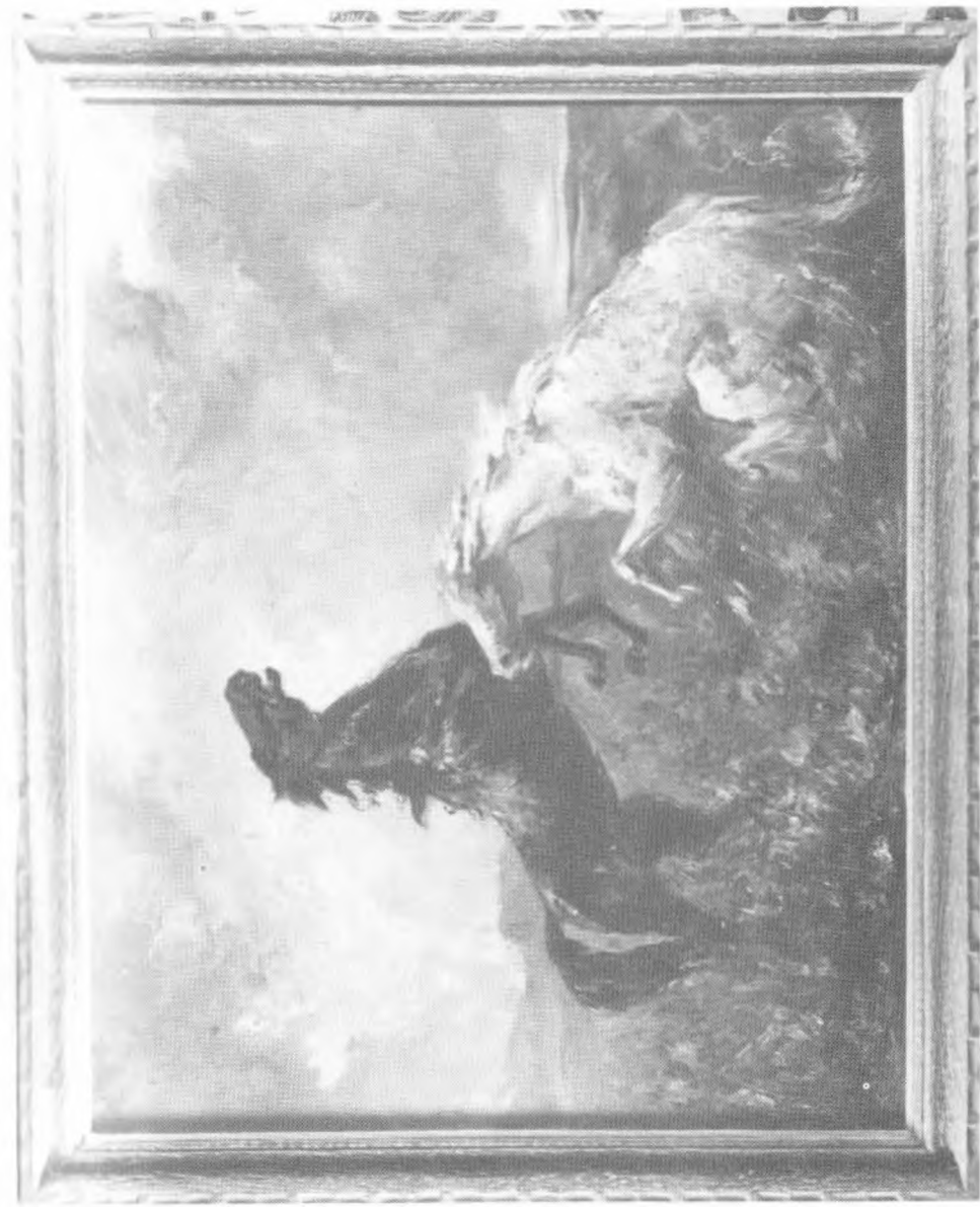
"Fight" — painted by author