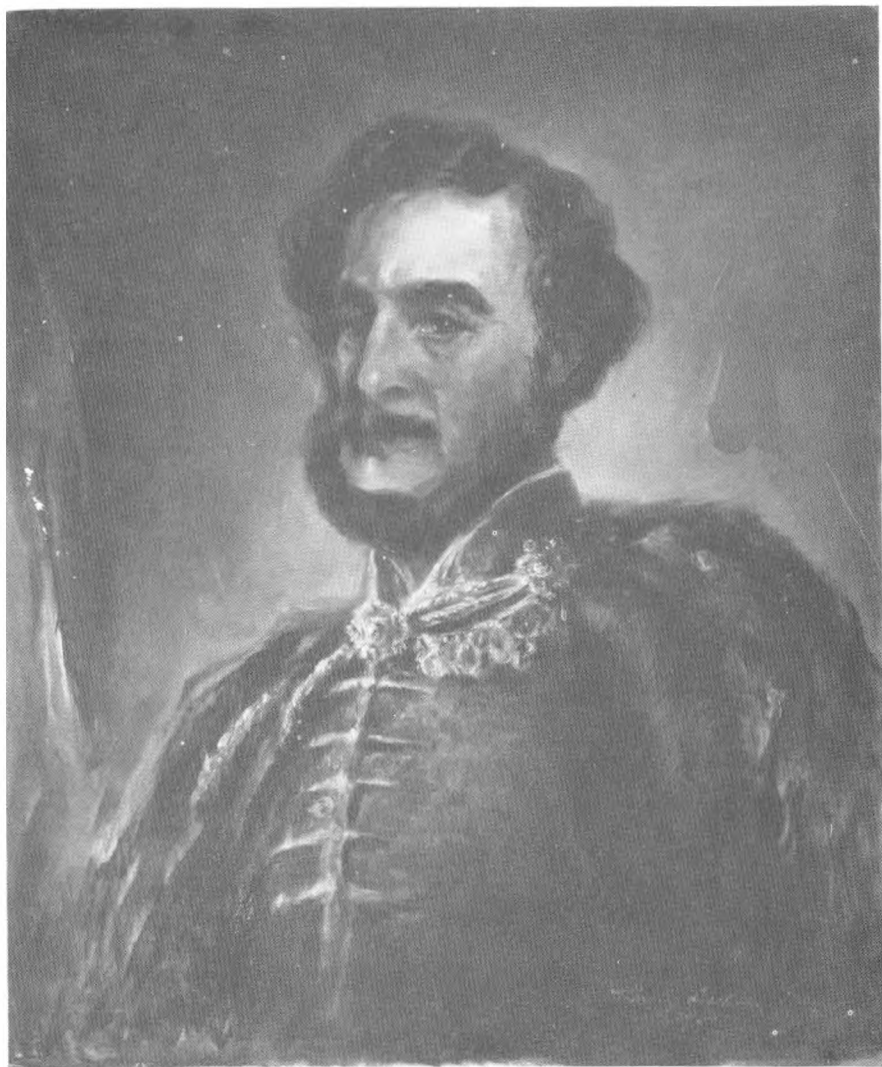
"Count István Széchenyi" — painted by author