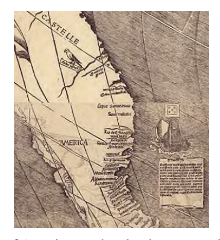
The name of America can be clearly seen on this section

The full name of the map: " Universalis cosmographia secundum Ptholomaei traditionem et Americi Vespucii aliorumque lustrationes ", that is: Universal World Map according to the tradition of Ptolomeus, and the discoveries of Amerigo Vespucci and others.