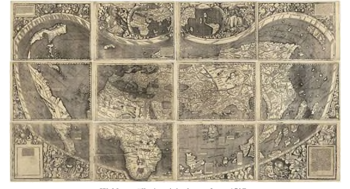
Waldseemüller's original map from 1507,

Assembled from 12 woodcuts, into s 4' X 7.5'spread