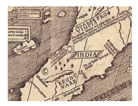
Detail of the map showing the name "India," on the Asian continent

(http://en.wikipedia.org/wiki/File:Waldseemuller_map_closeup_with_Catigara_and_Mallaqua.jpg)