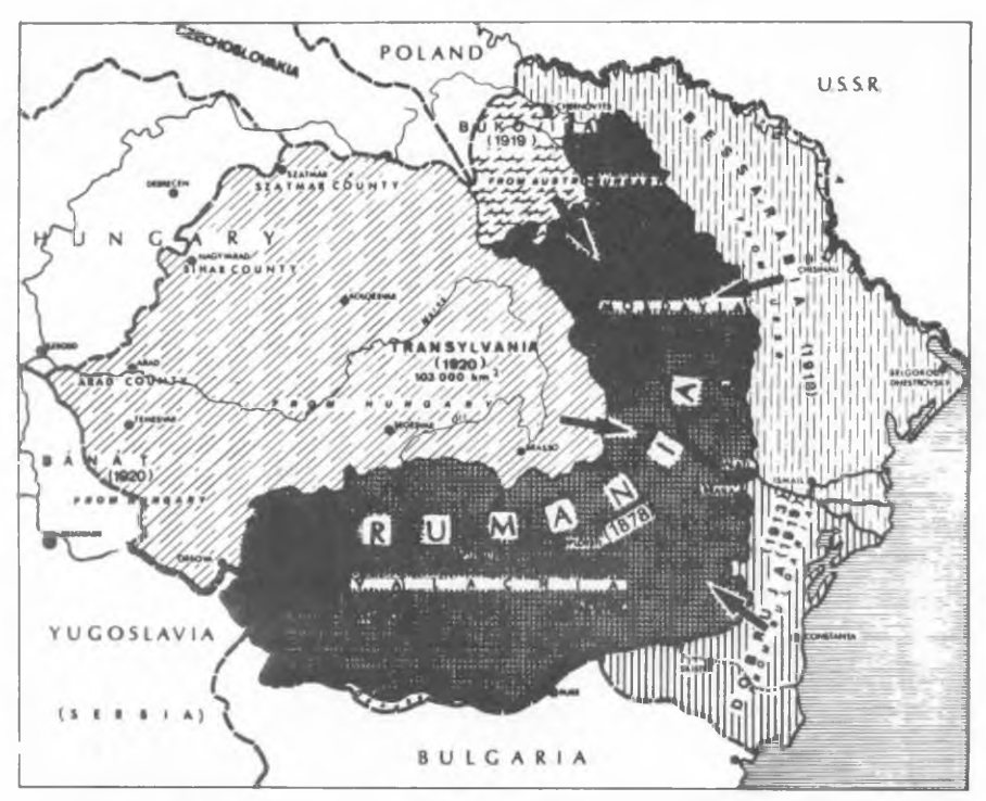
Map showing Rumania from after the Congress of Berlin (1878) to the Treaty of Trianon (1920)