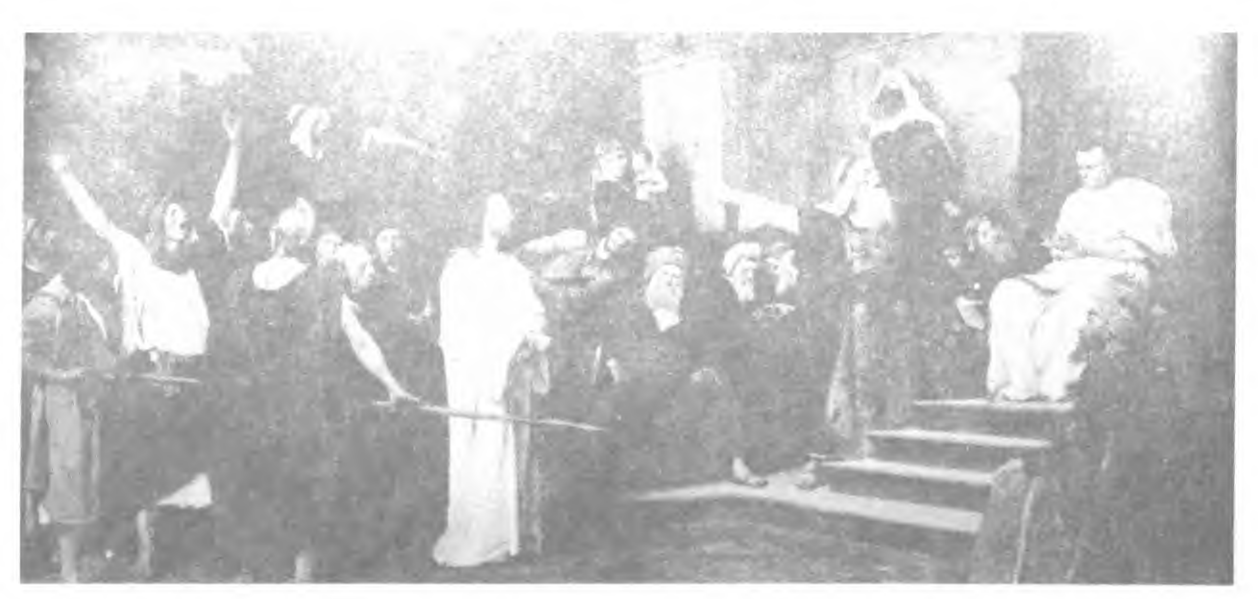
M. Mukácsy: Christ Before Pilate, oil, 20'x13' Philadelphia, Wanamaker.

religious paintings. His 20'x13' "Christ Before Pilate" and "Christ on Calvary" were bought by Mr. Wanamaker, owner of the Philadelphia Department Store for 200,000 Golden Franks.