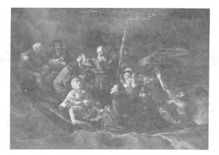
Michael Zichy: Lifeboat, 1847.

Russia and also became one of the greatest illustrators of his age.