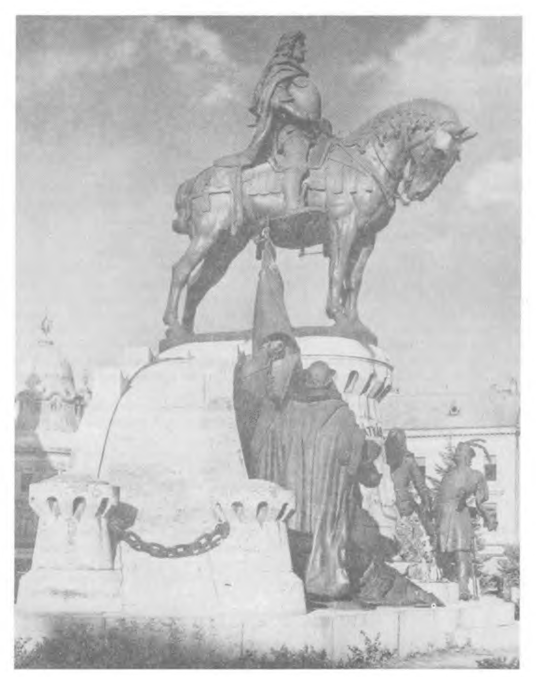
John Fadrusz's statue: King Matthias in Kolozsvár (now Cluj, Rumania).

Palace in Budapest. Fadrusz exhibited all over Europe, and died as a famous man in 1903.